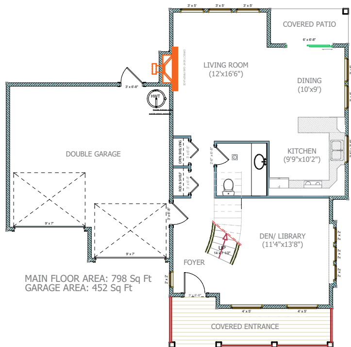
MAIN FLOOR AREA: 798 Sq Ft GARAGE AREA: 452 Sq Ft